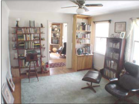
The 13.6x11.8 ft family room could be a 3rd bedroom. The hardwood floors extend through all but the kitchen.

3600 Glenwood Ave Raleigh, NC 27612 919 782-5502