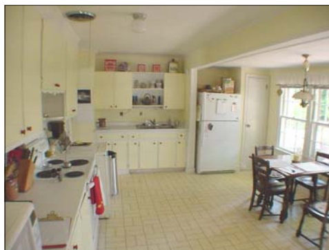
It really is a big bright kitchen with lots of storage.

Check out my portfolio of past and current listings, and learn more about this and other neighborhoods at www.peterRumsey.com .