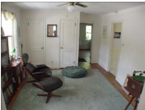
Another view of the family room shows the two closets and the bedroom wing of the house that can be closed off from the social rooms.

Large 0.21 fenced lot. Workshop/Storage building. $94,900. tmls#749658.