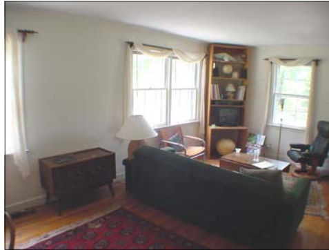
The combined living-dining room is 22 feet long giving you plenty of flexibility in deciding whether you want to put a dining room table here or in the large kitchen.

Peter Rumsey, Broker 919.971.4118 www.peterRumsey.com