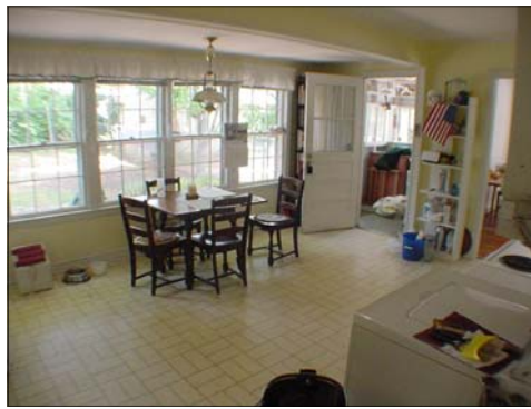
The bright 17x13.6 ft kitchen with a wall of windows is a rare treasure. A small utility/mud room leads outside.