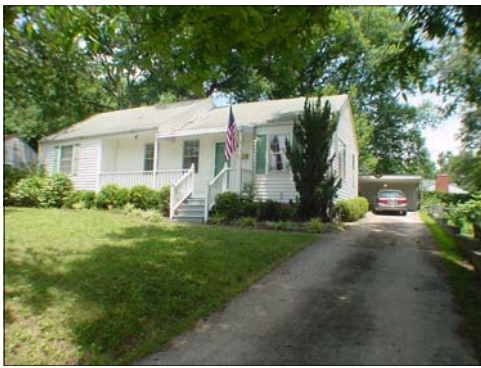
This home has a remarkably contemporary floor plan plus a fenced yard, patio, carport and a workshop/storage building.