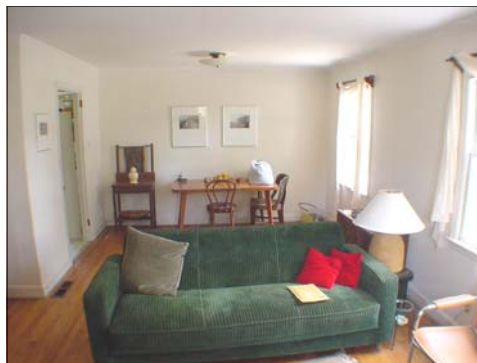
This is the view looking from the front of the living room toward back with kitchen on the left.

You can download a flyer and floor plans from www.peterRumsey.com