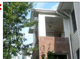
710 N. Person St #306 Raleigh, NC 27604