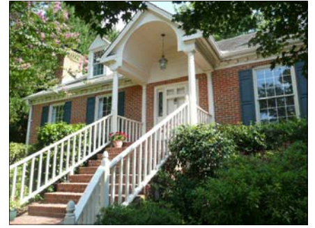
1415 Park Drive Cameron Park