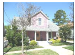
The May Budd House c.1921 405 N. East St Raleigh, NC 27604