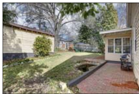
910 Dorothea Drive