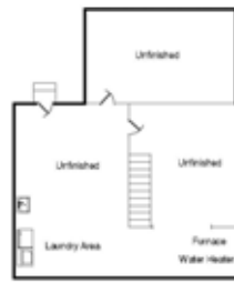
(Open to Crawl Space)