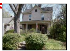
516 N Bloodworth St Raleigh, NC 27604