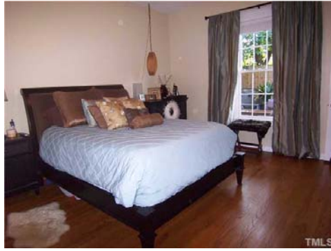
The master bedroom overlooks and is just steps away from the back garden and the hot tub.