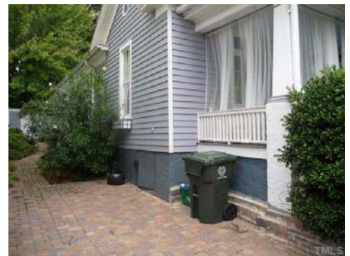
A brick-paved parking pad and winding, landscaped path leads back into the fenced garden with on-grade access to the rear entrance.