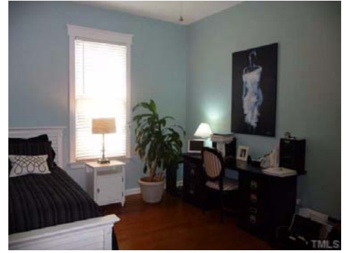
The versatile middle bedroom, now used as an office and guest room, opens to both the central hall and the master bedroom.