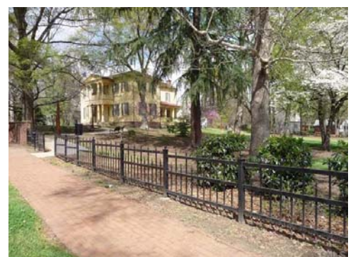
Family friendly Friday night concerts are a neighborhood gathering place on the lawn of the Mordecai Historic house and park that is located in the nearby Mordecai national historic district.