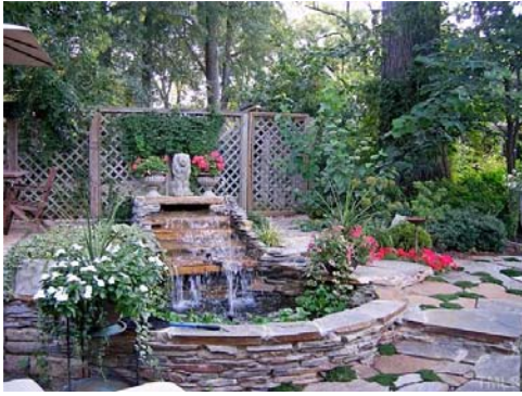
This is the pot-of-gold outside the family room window and rear entrance. An ideal flow for entertaining in and out.