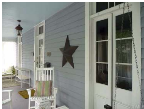
Two sets of double French doors with transom windows lead to the large front porch.