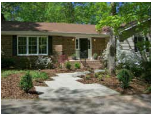
The yard features new landscaping, including a small fountain.