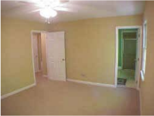
Master bedroom features a private full bath and a large 9.5 x4.5 walk-in closet.