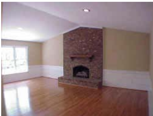
New oak floors throughout the entry, LR, DR and kitchen. In the spacious 16 x22 living room, a masonry gas fireplace.