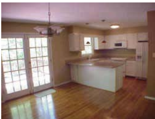
The dining room opens to the kitchen which includes new granite countertops, high-end appliances and pendant lighting.