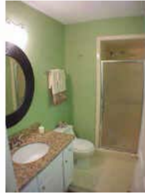
Master bath has a window and granite countertops.

TEMPO Software Copyright © First American MLS Solutions, Inc. 1997-2007 All Rights Reserved V3.0 All Information contained herein is for the exclusive use of authorized MLS Subscribers Copyright © TMLS 2001-2007 North Carolina Triangle MLS, Inc. All Rights Reserved Support: Email Help Desk or Call 919-654-5419