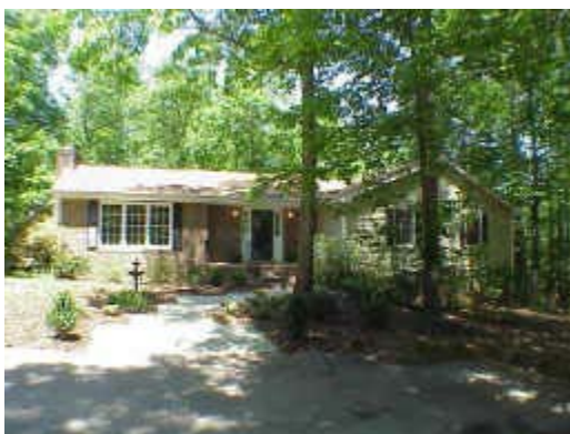
The home is set back from the street on a .33 acre wooded lot.