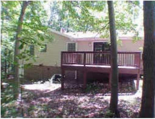
The house is surrounded by natural, low-maintenance landscaping.