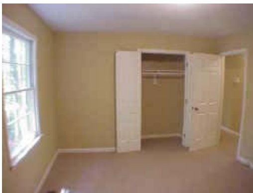
New Karastan carpeting and large closets in bedrooms.