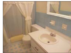
That is real tile in the updated bath & kitchen.

The large eat-in kitchen has lots of cabinets and opens to the living room with a vaulted ceiling. The kitchen side door leads to a wrap around deck.