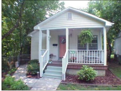
Mountain top privacy overlooking a creek.