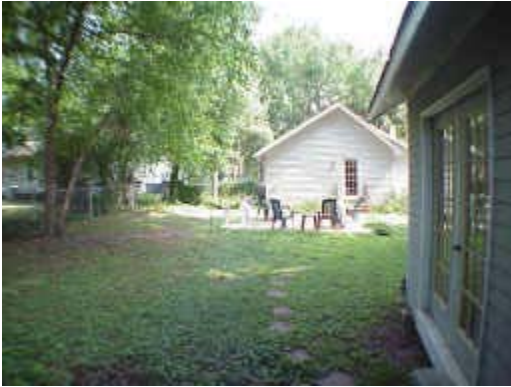
The fenced yard includes a 16x15 ft patio and a 12x10 storage shed/studio with lots of windows.