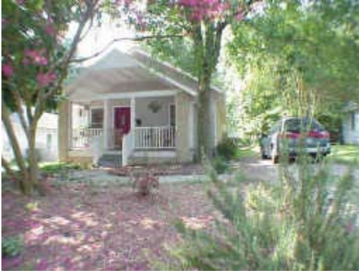
Crepe myrtles trees frame this 3 bedroom, 2 full bath renovated home.