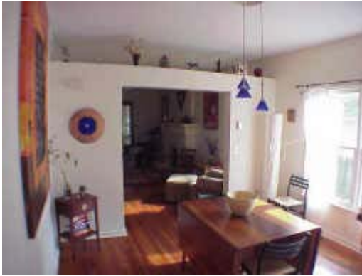
This home has it all. Lots of closets. Versatile spaces. Floor plan available.