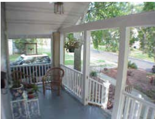
The large front porch is just blocks away from Historic Oakwood and the Mordecai House.