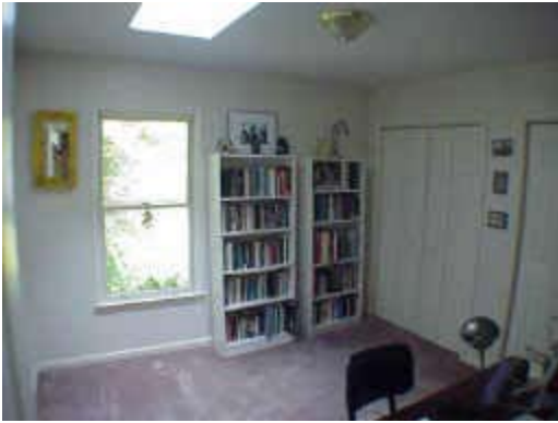
A skylight brightens the back 3rd bedroom, currently a study for 2 professors.