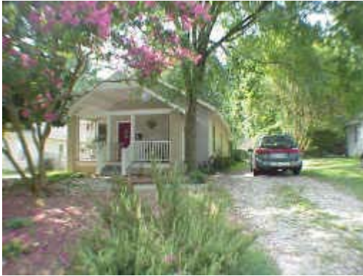
The gravel driveway gives access to the big side and back yards.

MarketLinx TEMPO Software Copyright © Interactive Data Development, Inc. 1997-2005 All Rights Reserved All Information contained herein is for the exclusive use of authorized MLS Subscribers Copyright © TMLS 2001-2005 North Carolina Triangle MLS, Inc. All Rights Reserved Support: Email Help Desk or Call 919-654-5419