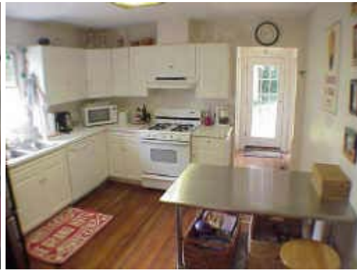
Lots of cupboards, light & space plus a nearby patio & laundry - a thoroughly modern kitchen and home.