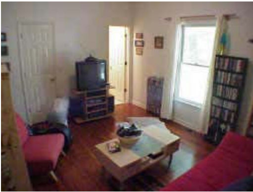
3 BR and 2 full updated baths. This is the master suite now in use as a den.