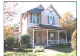
The Wayne Alcott House c. 1893 500 Polk St Raleigh, NC 27604