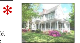
The Walter Clark House c. 1895 315 Polk St Raleigh, NC 27605