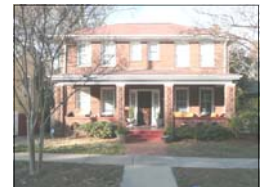
The Pizer-Abbott House c.1921 313 Polk St Raleigh, NC 27604