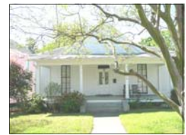
408 Oakwood Ave Raleigh, NC 27601