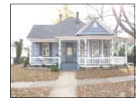
J. T. Moore House c.1893 312 Oakwood Ave Raleigh, NC 27601