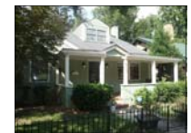
c.1940 519 E Lane St Raleigh, NC 27601