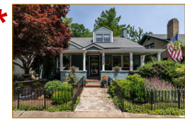
Samuel Golden House c.1940 519 E. Lane St Raleigh, NC

514 Daniels St St #177, Raleigh NC 27605