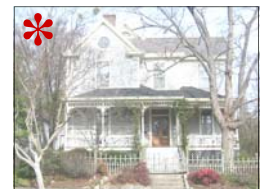
The R. L. Horton House c.1897 323 E. Lane St