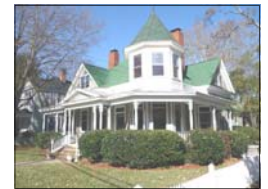
The William J. Jones House c. 1899 409 E. Jones St Raleigh, NC 27601