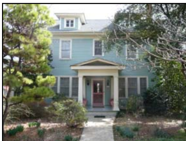
315 S. Boylan Ave.

... The pedestrian scale of Boylan Heights, established by the original sidewalks, streets, trees, and service alleys, is still maintained. The wide, curving sweep of Boylan Avenue presents a promenade of trees and receding house facades. This sort of grand entry provides a focus for the neighborhood and reflects the ambitions of its original residents, to create a place of beauty and elegance, spaciousness and trees.