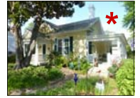
* Henry Clay Johnson House C. 1874 404 N Bloodworth St Raleigh, NC 27604