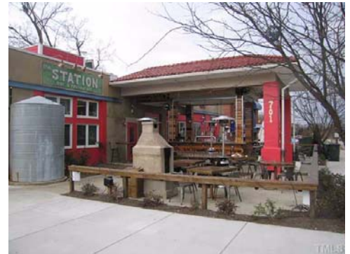
Recently named one of ten hot spots in USA Today, the nearby Person Street shops include the Station, PieBird, Oak City Cycling, Yellow Dog bakery/cafe, a music store & venue, small book store and a pharmacy/lunch counter dating back to 1910.