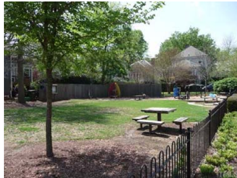
The Oakwood Common is a play area for toddlers. Canines can play at the nearby Oakwood Dog Park. Oakwood events include spring jazz brunch, 4th of July picnic, Candlelight Tour and monthly pot-luck suppers.