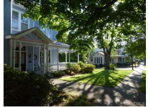
The 1993 TV movie, The Portrait, was set in the house diagonally across the N Bloodworth St intersection. The value of property in Oakwood is increased by its status as a local Historic District, the first in NC.