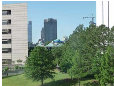
Walk everywhere. This is the view from the nearby NC AIA Center for Architecture and Design looking south past the state government offices, legislative building, museums and the old Capitol to the private office and residential towers.