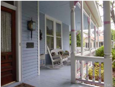
The Historic Oakwood neighborhood is an eclectic urban village seamlessly surrounded by unique urban neighbors including the Burning Coal Theater a short walk away.