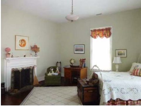
The south east corner bedroom could become a master suit by adding a bathroom in an adjoining 2nd floor attic space. This may be eligible for NC Rehab tax credits provided that an application is accepted before the end of the year. Floor plan available.