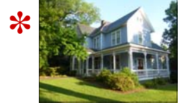
The Walter Clark House c. 1895 315 Polk St Raleigh, NC 27605