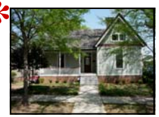
319 Polk St Raleigh, NC 27604