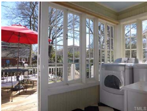
The renovated kitchen opens to a large back deck through the glass-walled space now used as a laundry. Garden beds and a concrete basketball pad offer recreation options. A daylight basement with 3/4 concrete floor provides storage and workshop space.