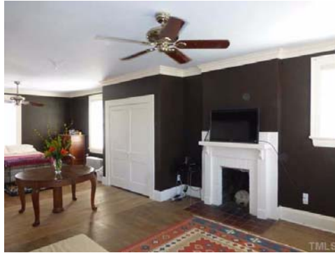
The MLS shows 3 bedrooms, however, currently the 2nd floor is one large master suite, probably the biggest in Mordecai. It is the dream realized by the sellers who remodeled 3 bedrooms into one large space 31x14.9 ft.