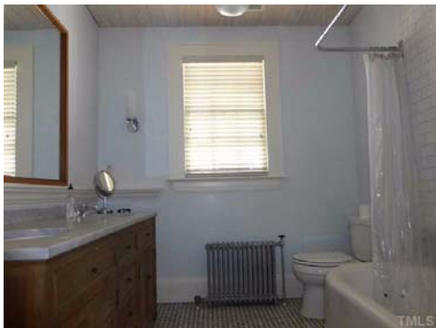
The existing upstairs bath was completely remodeled by Tom Brown last year. It features a double vanity with subway tile surround, marble top and basket weave marble floor.