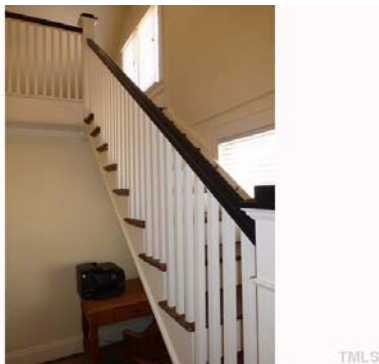
The sellers added stairs to the attic in a small room that is used as an office.