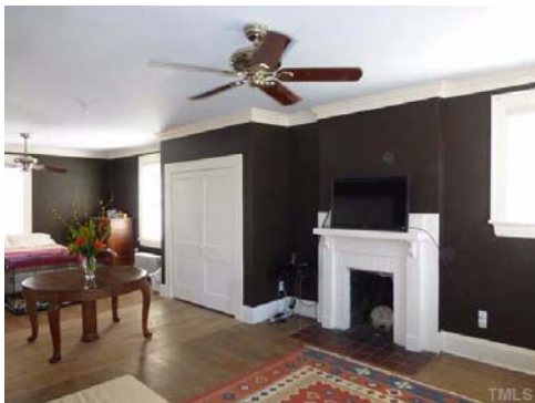
The MLS shows 3 bedrooms, however, currently the 2nd floor is one large master suite, probably the biggest in Mordecai. It is the dream realized by the sellers who remodeled 3 bedrooms into one large space 31x14.9 ft.