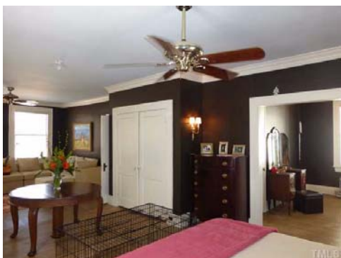
The former 3rd bedroom (to the right) now provides a convenient sitting area as part of the master suite. Option #1 retains the sitting room that would be attached to the back 2nd bedroom. Option #2, the allowance, makes it a 3rd BR with closet.