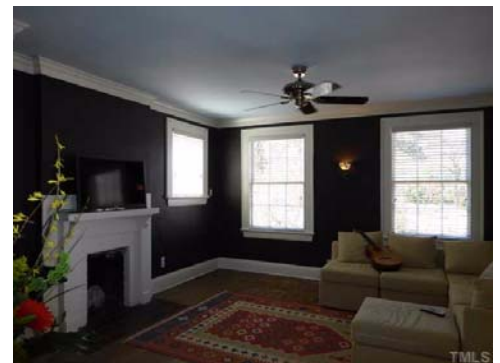
Zoned heat pumps provide heat and air on all three levels. A gas fired steam boiler, new in 2007, heats the 1st and 2nd floors. The main roof was new in 2007 as is the copper lower edge of the front pedimented gable.