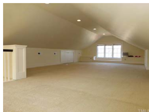
The sellers used the 374 sqft as a bedroom. It is heated and cooled by a heat pump new a couple years ago. The attic is not included in the 1,939 living sqft because it doesn't meet the minimum requirements for ceiling height 7 ft or higher.