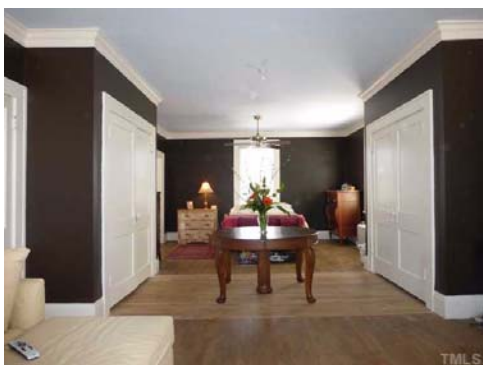
Proposal #3 is similar except that the current sitting room would become a master bath for the back bedroom. All 3 options replace the facing closets with a wall and two comparably sized closets, one for each BR.