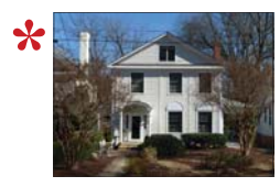
1216 Mordecai Dr Raleigh, NC 27604