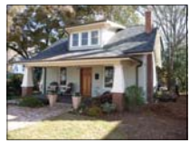
1108 Mordecai Dr Raleigh, NC 27604