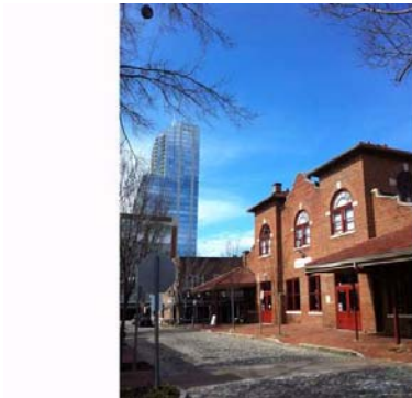
Artspace shares its block with the historic City Market, home to a coffee shop, restaurants, shops and offices. The sun does shine in Raleigh.