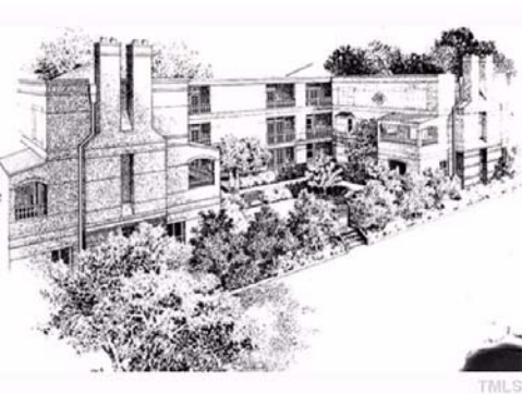
This is a pop up view from the original 1980s brochure. A copy of the brochure is included in the mls Docs.