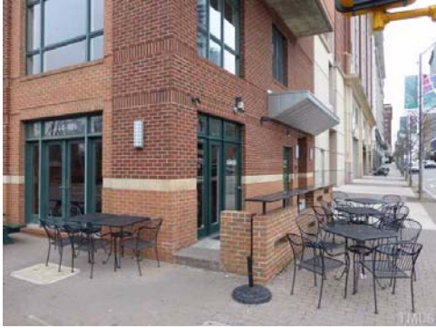
The corner cafe in the Palladium Condo building which shares the Blount and Davie intersection with Artspace and Founders Row.