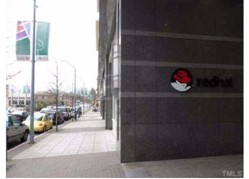
The Red Hat entrance is across Davie St from Coopers. Looking back toward Artspace and Founders Row, the banners celebrate the Moore Square Park which is the next block north of Artspace.