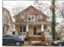
731 S Boylan Ave Raleigh, NC 27603