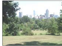
Dorothea Dix Park