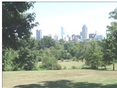
Dorothea Dix Park, NC Farmers Market, NCSU Centennial Campus

Immediately across Western Blvd, to the south & southwest, are over 300 acres the State recently sold to the City of Raleigh. Now in the planning stage, the park land is open today. You can enjoy the lush, tree shaded, rolling hills and grassy slopes. Learn more at dixpark.org . Just beyond Dix, additional State land has been developed as a Farmers Market and the NC State University Centennial Campus that includes a golf course and the new James Hunt Library shown here.