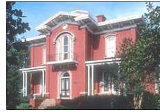
(Next door) Montfort Hall 308 S Boylan Ave Raleigh, NC 27603

.... The pedestrian scale of Boylan Heights, established by the original sidewalks, streets, trees, and service alleys, is still maintained. The wide, curving sweep of Boylan Avenue presents a promenade of trees and receding house facades. This sort of grand entry provides a focus for the neighborhood and reflects the ambitions of its original residents, to create a place of beauty and elegance, spaciousness and trees.