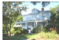
(For sale) 316 S Boylan Ave Raleigh, NC 27603