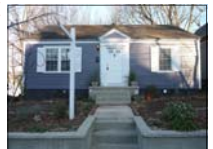
520 N Bloodworth St Raleigh, NC 27604