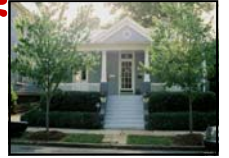
111 N Bloodworth St Raleigh, NC 27601