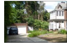
2 bay garage 19.5x20 ft