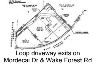
Loop driveway exits on Mordecai Dr & Wake Forest Rd