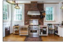
Professional 6 burner gas range