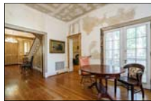
French doors (8 sets installed)