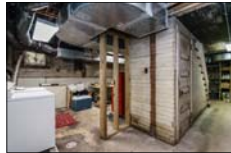
Unfinished basement includes wine cellar & has poured concrete foundation walls.