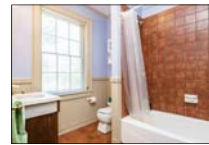
Back stairs lead up & down to mezzanine full bath.