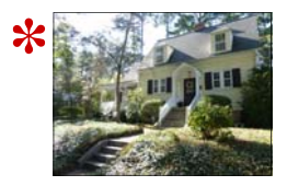
1315 Mordecai Dr Raleigh, NC 27604