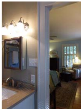
And a real Master Bath.