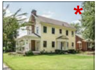
* 1230 Mordecai Dr Raleigh, NC 27604