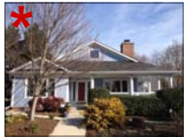
609 Leonidas Ct Raleigh, NC 27604