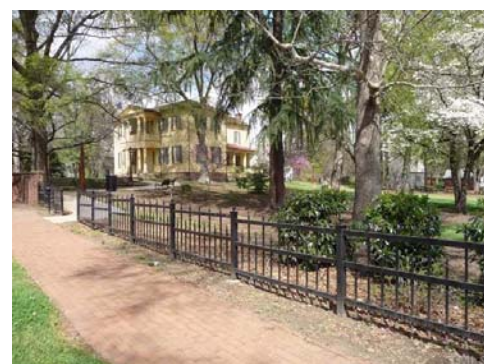
Periodic family friendly Friday night concerts are a neighborhood gathering place on the lawn of the Mordecai Historic House and park and at the nearby Seaboard Station.