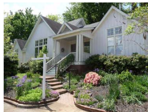
A curb cut remains where a parking pad was originally planned but not pursued by the seller. The seller is having plans drawn for a parking option that would require the approval of RHDC, the Raleigh Historic Development Commission.