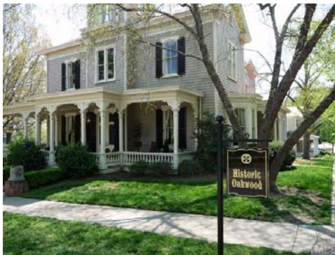
The Historic Oakwood neighborhood is an eclectic urban village seamlessly surrounded by unique urban neighbors pictured below. The value of property in Oakwood is increased by its status as a local Historic District, the first in NC.