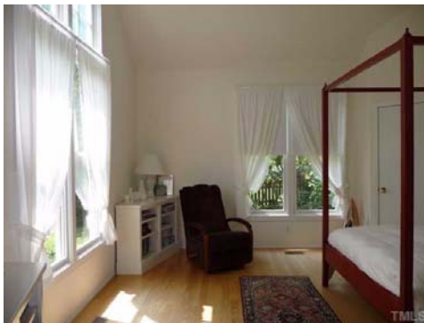
Stepping further back, this is the north view from the master suite showing the hardwood floors that extend throughout the house.