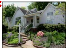
600 Leonidas Ct Raleigh, NC 27604