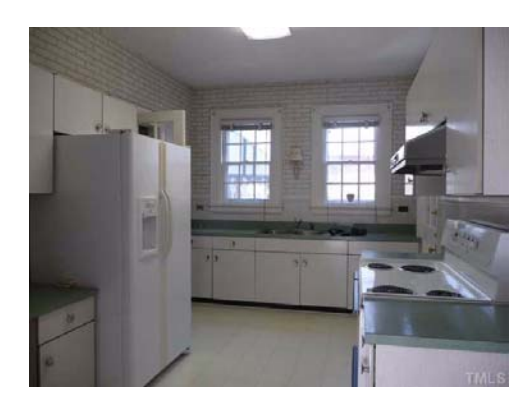
NC Rehab tax credits may be available to offset the cost of updating the kitchen and possibly expanding it to include the existing adjacent utility room now uses as a laundry.