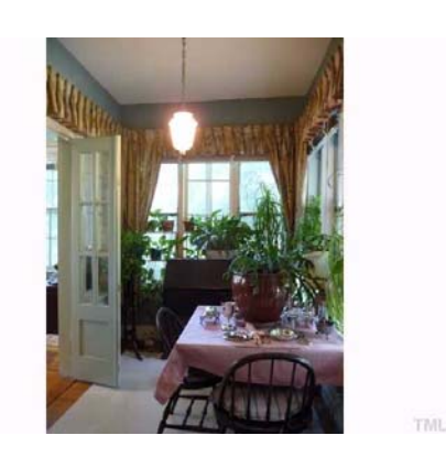
Breakfast room and office were the most recent uses of the space.