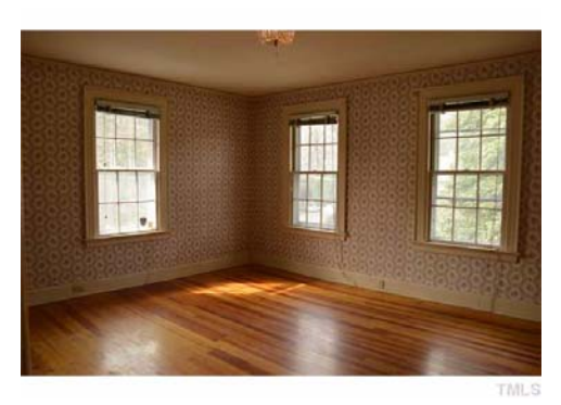
The master bedroom is 17x14.5 ft. The pink-tiled Master bath has marble-walled shower. Updating baths and interior wall finishes are among the cost that may be eligible for NC Rehab Tax Credits.