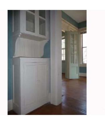
Not shown is a walk-in pantry that opens into to the convenient hall shown above between the kitchen, dining and breakfast rooms.