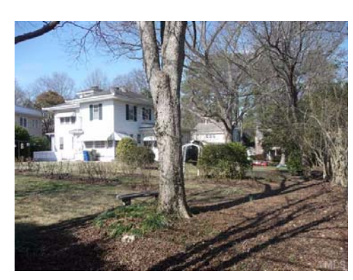
The centerpiece of the back and side yards is a professionally maintained rose garden.