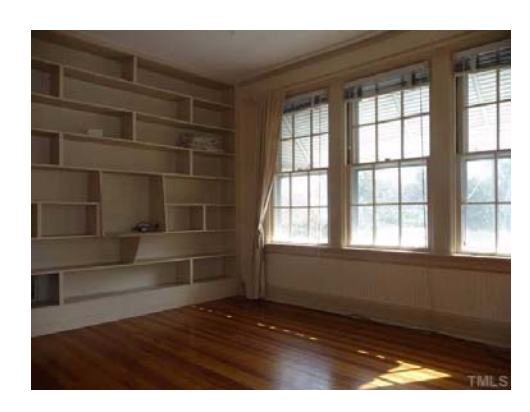
Upstairs, the fourth bedroom has been used as a library/sitting room.