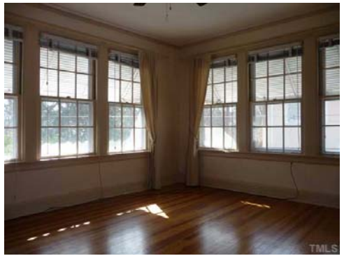
Two walls of windows catch the south west sun in the fourth bedroom.