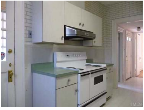
The left door lead to a enclosed back porch that could be part of an expanded kitchen. Next is the door to a half bath and beyond it the door to the back patio.