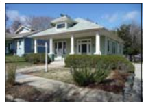
625 E Franklin St Raleigh, NC 27604