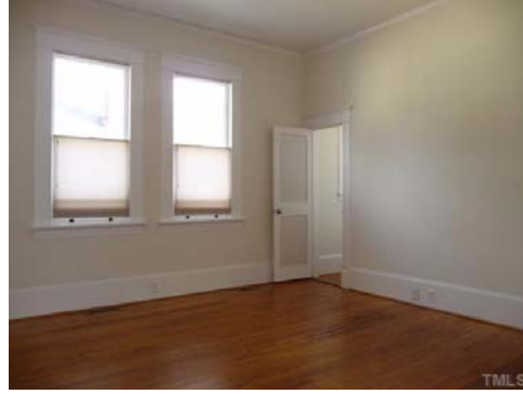
The master suite in the middle of the house has a large walk in closet and original hardwood floors. Window blinds throughout the house are double cellular top down bottom up blinds offering optimal privacy, extra insulation and natural light.