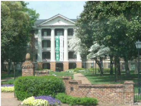
Teach, study or attend concerts at William Peace University.