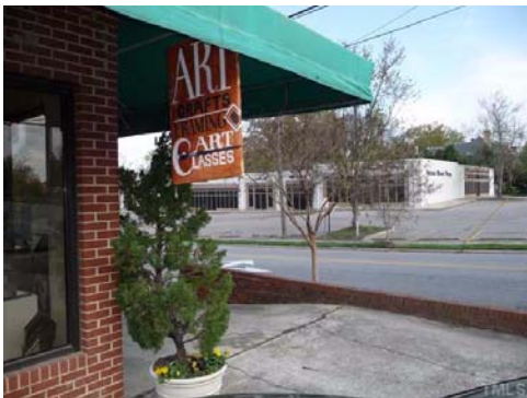
Adults can play and shop at the nearby Person Street shops that include Oak City Cycling, Slingshot Coffee, Nicoles Art Gallery, Rapid Fitness and more coming. Buy vegetables and volunteer time at the non-profit Raleigh City Farm at end of Franklin St.