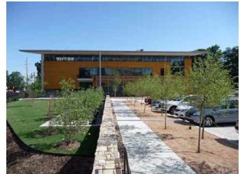
Across from the Peace University, the new NC AIA Center for Architecture and Design is a venue for community meetings and celebrations. It is part of the Blount Street Commons development providing live-work-play options that include Gallery C.