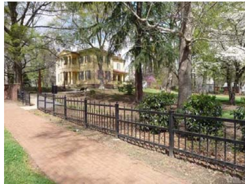
Family friendly Friday night concerts are a neighborhood gathering place on the lawn of the Mordecai Historic house and park that is located in the nearby Mordecai national historic district.