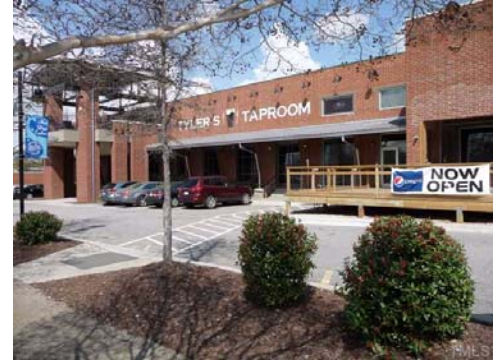
Seaboard Station includes Ace Hardware, Tylers Taproom, Logans nursery, Phydeaux Pets, Marigold Parlor, J Betskis, Galatea Boutique, Seaboard 18 and much more.