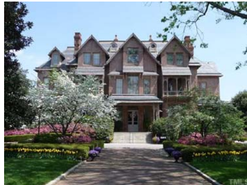
Visit the Governor or go to work in the state government offices.