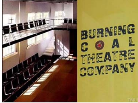
Or a play at the Burning Coal Theater.