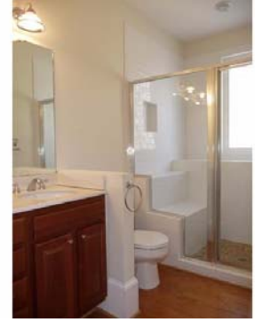
The unique large walk in master shower has a pebble stoned floor, tiled seating and large shower ledge with built in planter.