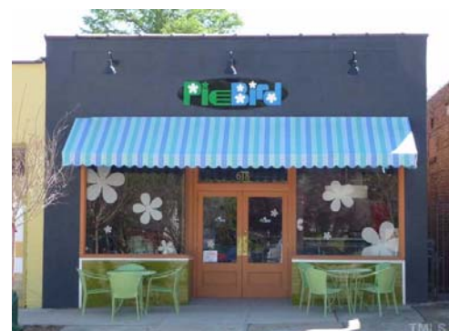
Lunch or and diner at the PieBird...