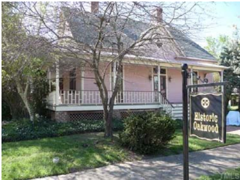
While located just outside the boundary of the non-profit Oakwood community association roughly marked by signs, many neighbors participate in Oakwood activities that include a 4th of July parade and picnic and holiday Candlelight Tour.