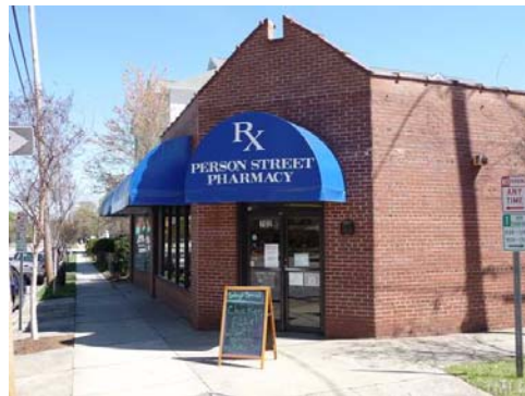
Grab lunch and an old fashioned vanilla coke at the Person Street Pharmacy...