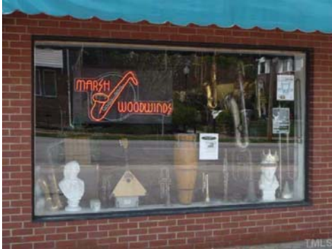
A jazz , blues or folk concert at Marsh Woodwinds...