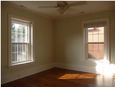
The three upstairs bedrooms each include two over 6 windows and decorative fireplaces.