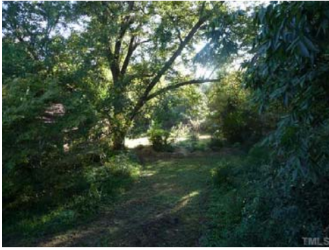
An urban Shangri-La - This is the view from the back deck of the private, multi-chambered back yard that includes the brightly sun lighted clearing in the distance.