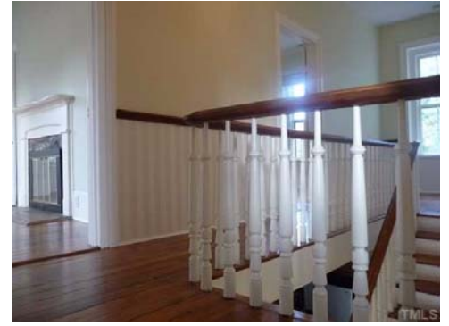
Upstairs is bright and elegant.