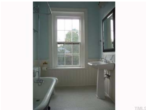
The second full bath upstairs remodeled in 2011.