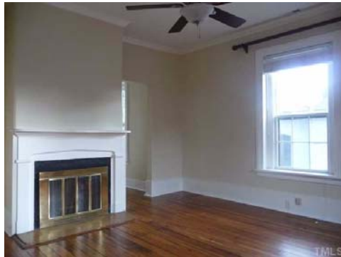
The true master bedroom suite includes a bath and closets added in what had been a fourth upstairs bedroom.