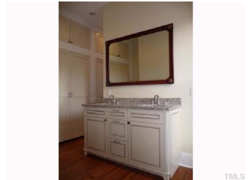
The new double vanity, closet wall and shower (pictured below) were added in 2011.