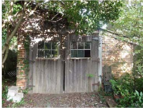
The picturesque old, very old, garage could be a workshop or studio. It is being sold as is. The driveway is shared with the Pullentown house next door.