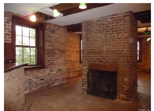
The grotto-like lower level has been home to many parties, including monthly Oakwood neighborhood pot-luck suppers. Heated and cooled, this is a versatile space with window on three sides.