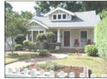
713 Dorothea Dr Raleigh, NC 27603