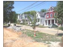
Dorothea Gardens A development of new & renovated homes.