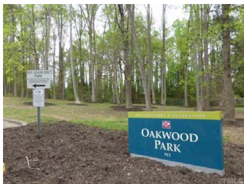
The Oakwood dog park is within walking distance as is the Raleigh Greenway along Crabtree Creek.