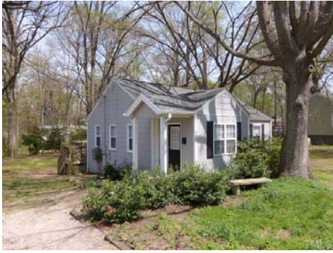
Bigger than it looks, this 3 bedroom, bright, open gem has it all on 0.32 acres.