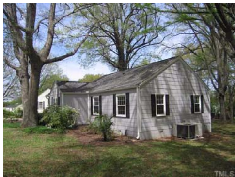
Much bigger than it first appears.