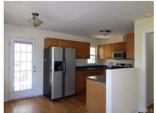
The kitchen area was also updated in 2007.