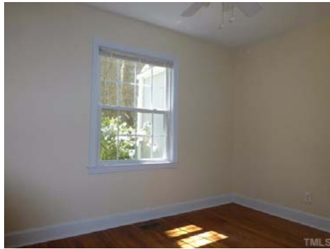
The front, middle bedroom has in some similar houses been opened to the living room, creating a flex space - den/office/studio/guest room - that is also part of the social areas of the house.