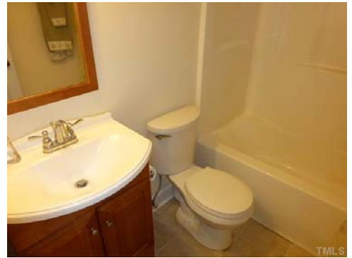
Bathroom fixtures were also update along with plumbing in 2007.