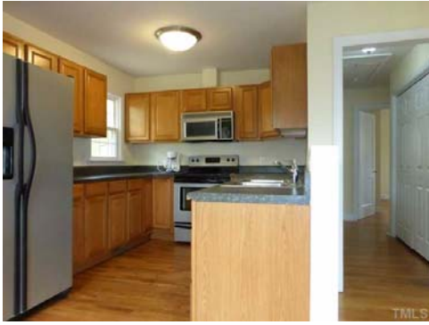
The hall leads past the washer/dryer space to the 3 bedrooms.