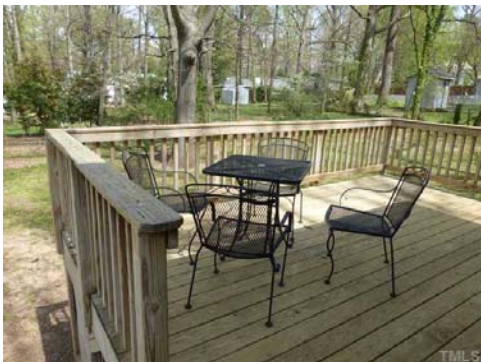
The great room opens onto the large porch.