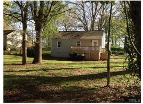
Sitting on the interior border of the Belvidere and Woodcrest neighborhoods, the location is convenient to both downtown and I-440 beltline. The 0.32 acre lot includes a gravel driveway and plenty of play and garden space.