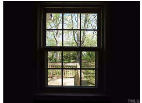
The view from the kitchen window.