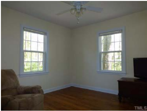
The back corner bedroom overlooks the back yard.