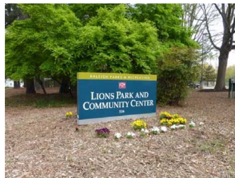
Walk to nearby Lions Park with a community center, numerous field and courts and more.