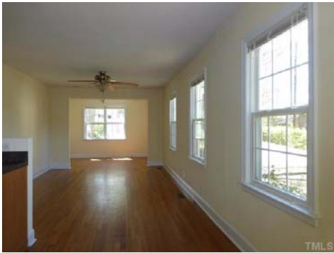
Art gallery opportunities are offered by the long interior wall. This is the wall that could be opened to the middle bedroom creating an even greater room.