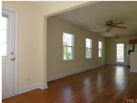
The aha moment is when you step inside. The entire left side is a great room with hardwood floors leading back to a big deck and modern kitchen.