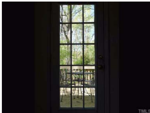
The view from the back of the great room.