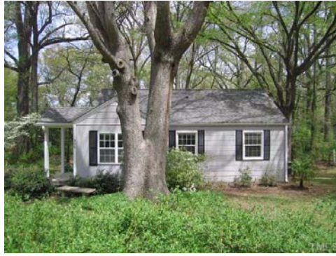
New windows, roof, gas HVAC, appliances, fixtures and much more were part of a major renovation in 2007 by the seller who lives across the street.