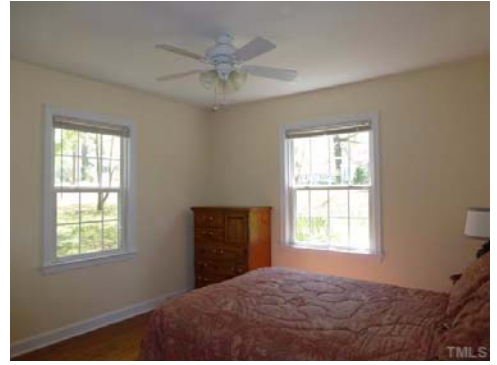
The front corner bedroom.