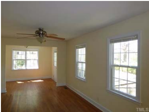
This is one of the few Belvidere homes that has an entrance foyer/sun room. South facing, the room catches the sun throughout most of the day.