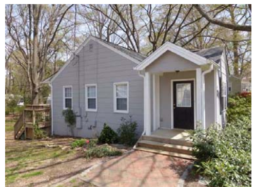
A brick walkway leads to the front door from the gravel driveway.