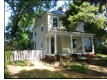
420 Cutler St Raleigh, NC 27603