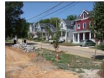
Dorothea Gardens A development of new & renovated homes.