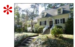
1216 Brookside Dr Raleigh, NC 27604