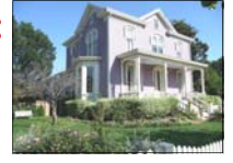
800 N Bloodworth St Raleigh, NC 27604